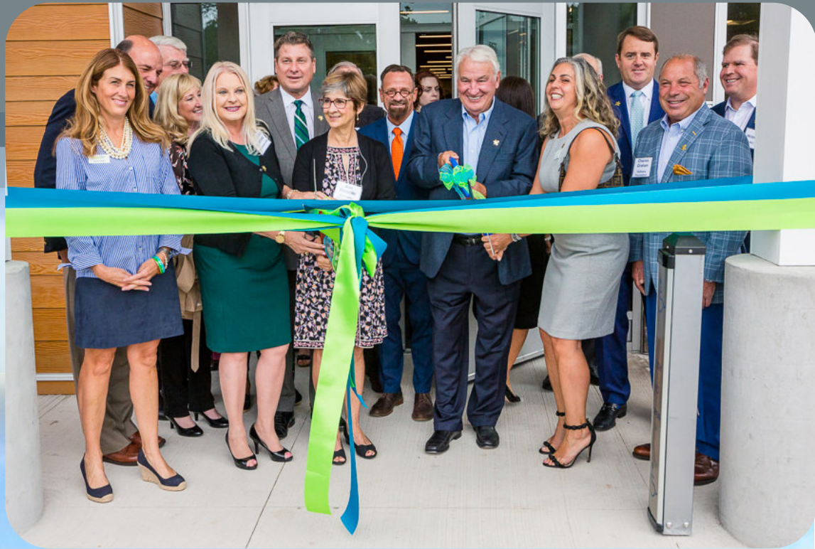
Members of Ability Partners, Inc., Ability Partners Foundation, Golisano Foundation, AutismUp, Wegmans, and Al Sigl Community of Agencies cut the ribbon at the opening of the Golisano Autism Center (above).