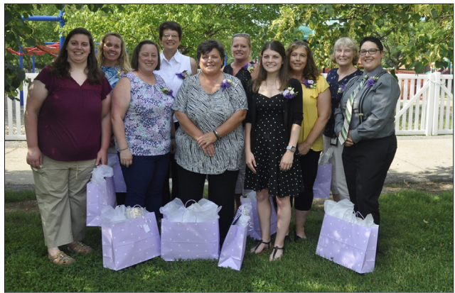
Professional Service Award Finalists