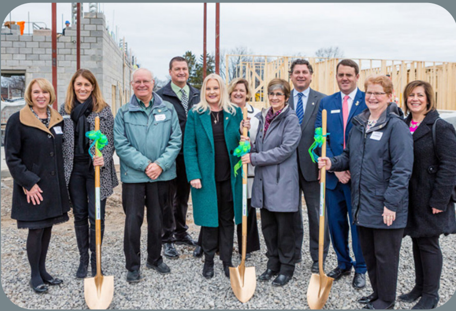
Members of Ability Partners, Inc., Ability Partners Foundation, Golisano Foundation, AutismUp, Wegmans, and Al Sigl Community of Agencies prepare for breaking down barriers with their ceremonial groundbreaking (above).