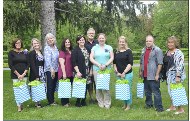
Professional Service Award Finalists