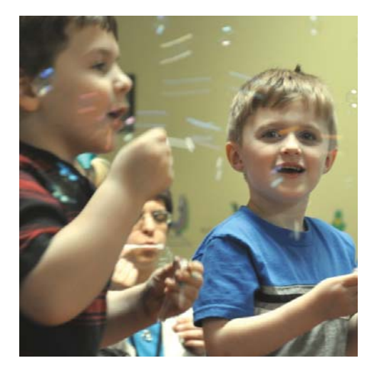
Continued on page 9

In the Rochester and Finger Lakes areas, CP Rochester, Happiness House, and Rochester Rehabilitation offer services to individuals of all ages exhibiting characteristics of or diagnosed with autism, including education, family support, evaluation services, residential, therapeutic, service coordination, and employment services.