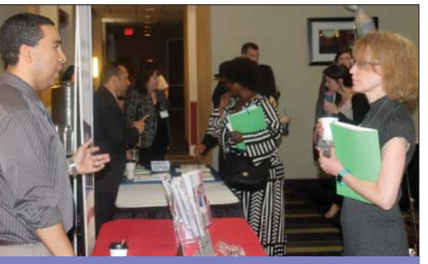
Networking opportunities at our vendor tables